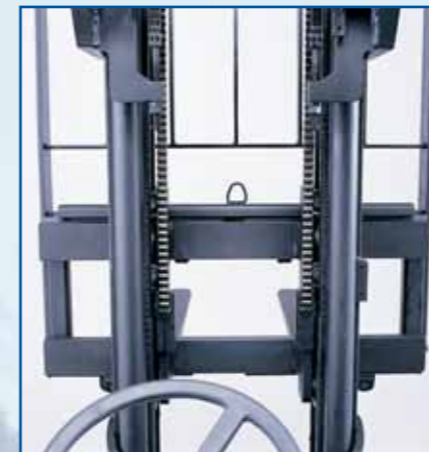
High-visibility window – loads are easier to see.

Cylinder placement allows for easy hook-up of hydraulic hoses to the internal reeving or hose reel.