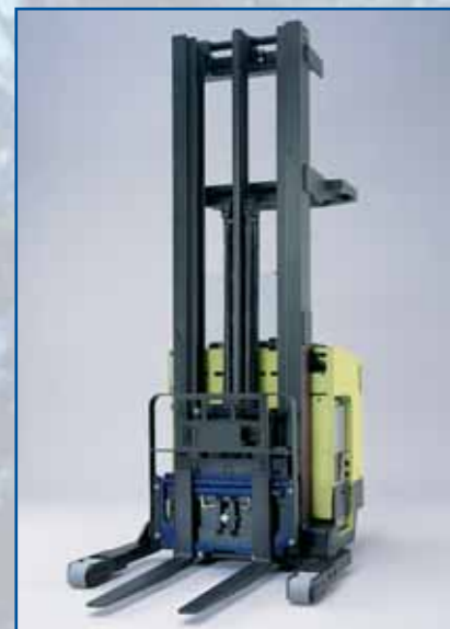
F-Series Sideshifter is designed to fit narrow-aisle lift trucks.

Adjustable lower mounting hooks, with patented serrated interface for positive adjustment.