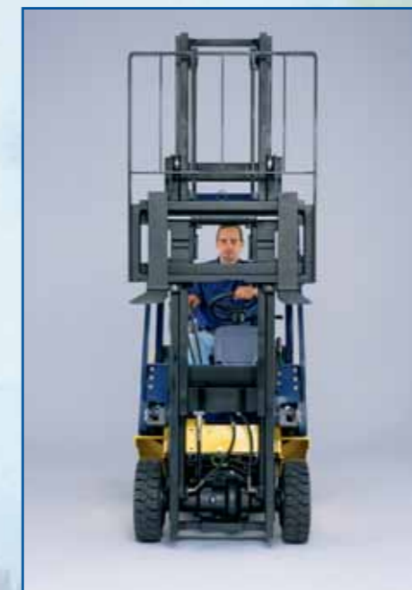
Driver visibility allows maximum productivity.